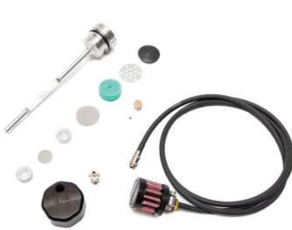
PART #3087 & 3088 M-EIGHT TOURING