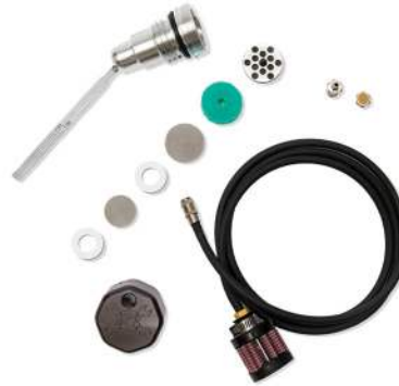
PART #3091 & 3092 TWIN CAM TOURING

The FEULING® billet dipsticks vent/breathe excessive crank case pressure from the oil tank through a PCV style breather, consisting of an oil separator system, perforated disc, replaceable filter element and umbrella flapper valve. Feuling vented dipsticks screw into the factory oil fill spout as a stock replacement part. These breathing dipsticks remove unwanted build-up of blow by pressure in the oil tank.